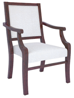
2780 Wood Stacking Chair