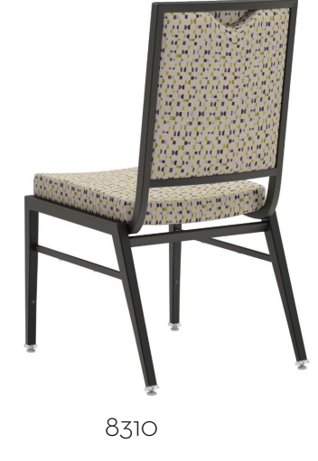
see more options at shelbywilliams.com