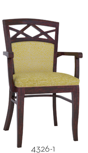
4326-1 Casters Available