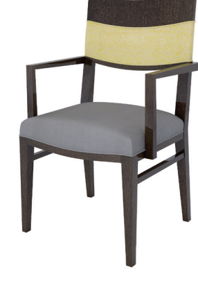
4906-1 Casters Available