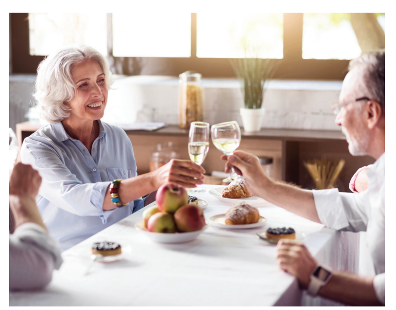
Our premium ergonomic suspension systems offer superior long-term comfort, and facilitate a sitter's circulation.