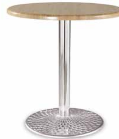
B28 Base / 17362 Top