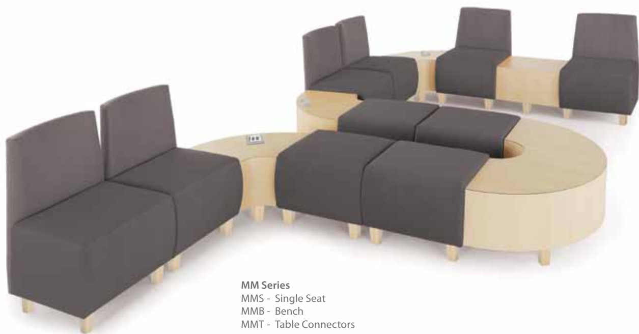
MM Series MMS - Single Seat MMB - Bench MMT - Table Connectors