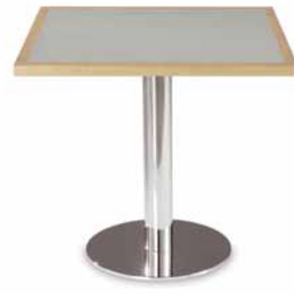
B53 Base / WE Top