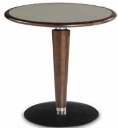
69A5 Base / WEBN Top