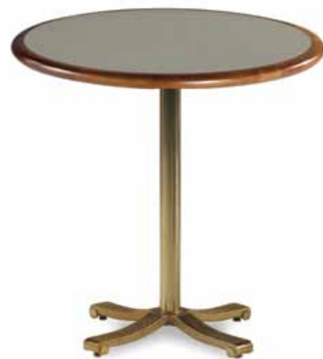
B62 Base / WEBN Top