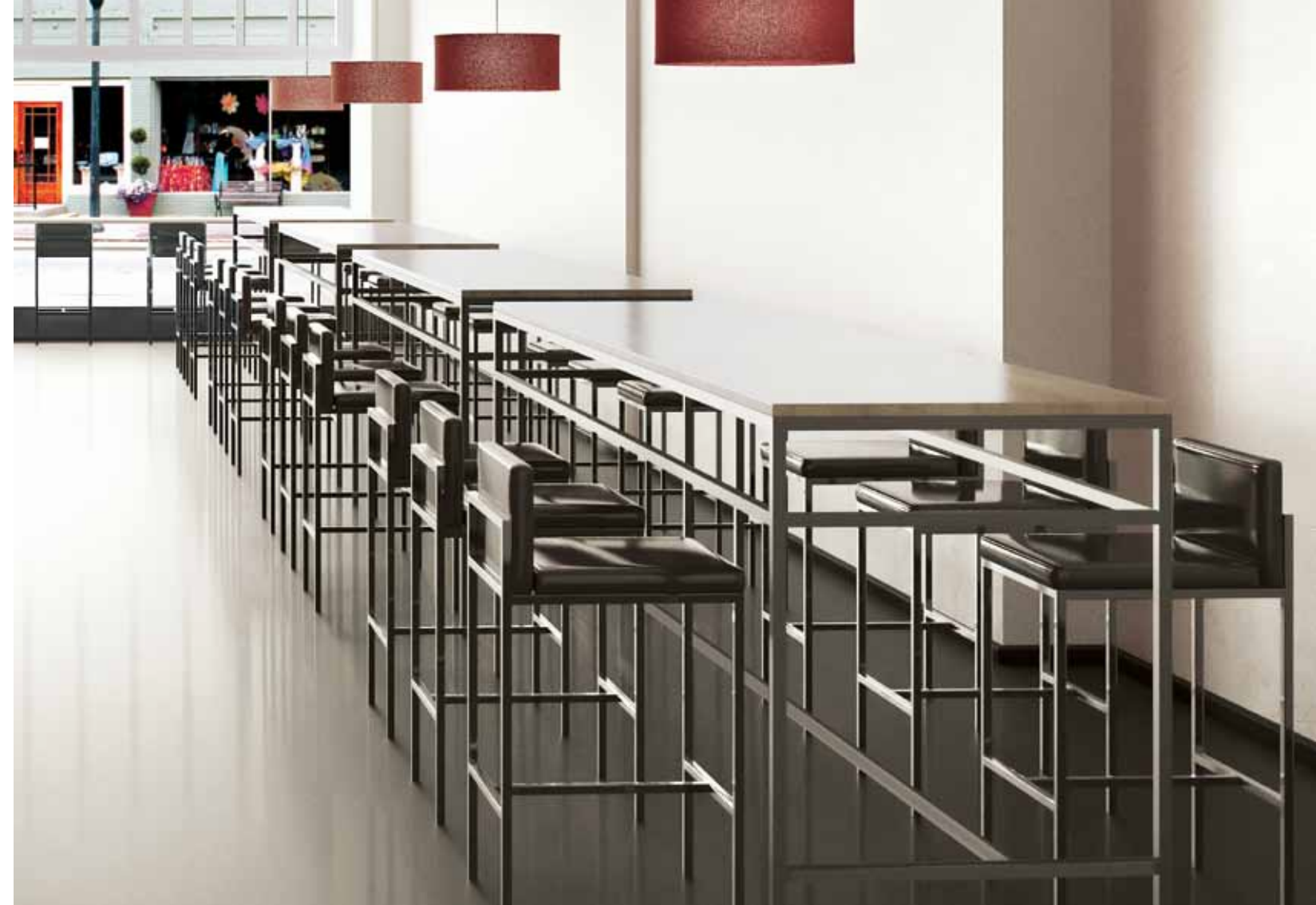
795T Community Table