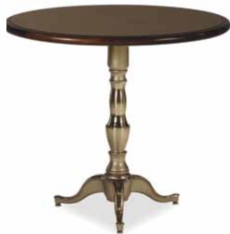
B78 Base / BNPT Top