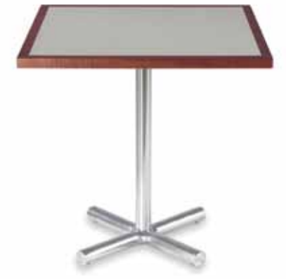
B56 Base / WE Top