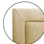
Plain Roll Border