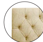
Deep Diamond Tufting

Create infinite design options by specifying upholstery, laminate and veneer.