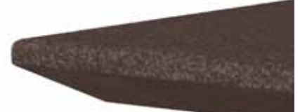
40733 1.18" (3 cm) thick reverse knife edge, quartz. Polished edges.