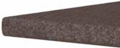
40711 1.18" (3 cm) thick square/eased edge quartz. Polished edges.