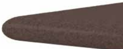
40722 1.18" (3 cm) thick bullnose quartz. Polished edges.